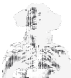
SHE IS HER, I AM SHE