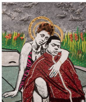
QUEEN & SLIM